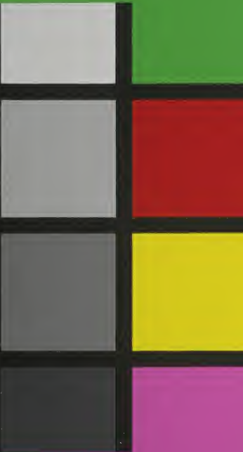
GretagMachbeth™ ColorChecker Color Rendition Chart