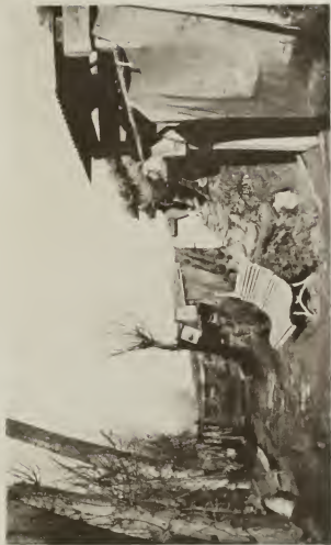
TRENCH BATTALION, HINDOOSTAN November, 1915—Cantonment, India.