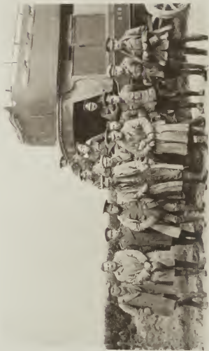
OFFICERS with Motor 1015