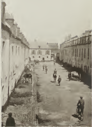
THE BARRACKS. GENERAL HEADQUARTERS.