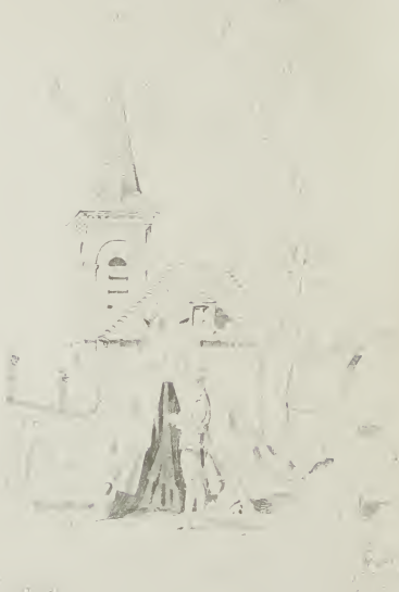
ENTRANCE TO CAMP REST BILLETS, MAY, 1916, WHERE THE LORD MAYOR SAW THE BATTALION ON PARADE