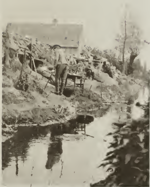
BATTALION HEADQUARTERS 11th May, 1915.